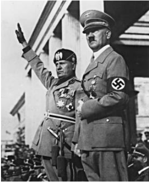
Mussolini & Hitler

considered part of Italy. They were only granted a small portion of the land they had hoped for. By the end of World War I, Italy was in desperate financial straits.