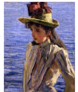
Ragazza sul lago (The Girl by the Lake) by Pietro Troubetzkoy (1889)

within the art form, not only as subjects for the libretti but also the style of the musical drama. By the 1890s, veristic operas were enjoying success not just in Italy but throughout Europe. Umberto Giordano's Mala vita (1892) continued the gritty tradition with a subject dealing with prostitution but found greater success four years later with his Andrea Chénier , based on the life of French poet André Chénier.