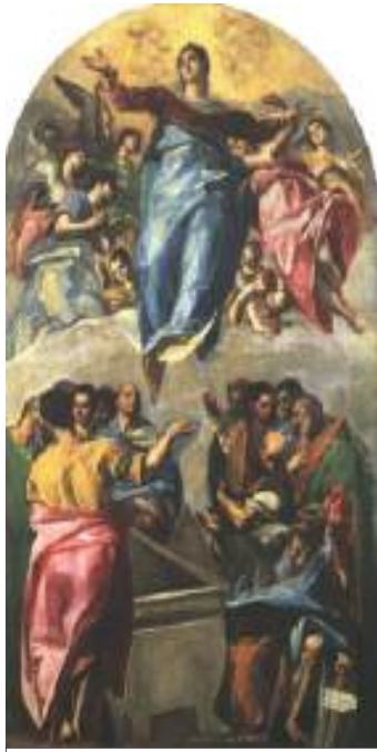
The Assumption of the Virgin Mary by El Greco

The Feast of the Assumption of the Blessed Virgin Mary (mother of Jesus) is a very important day in the Catholic religion. This feast celebrates Mary's death and her assumption into heaven. Note that "assumption" is not "ascension". This is an important distinction. Assumption means to be taken up or assumed into heaven by God. Ascension means going up to heaven through personal power (not through God directly) as Jesus did.