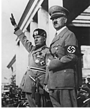
Mussolini & Hitler

Italy. In 1861, the Kingdom of Italy was official. Only Venice and Rome were not part of the new kingdom although within 9 years they would be. The Pope was furious (he had lost both Rome and a large amount of land) and he refused to recognize the new country.