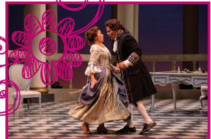
THE MARRIAGE OF FIGARO