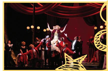
THE MERRY WIDOW